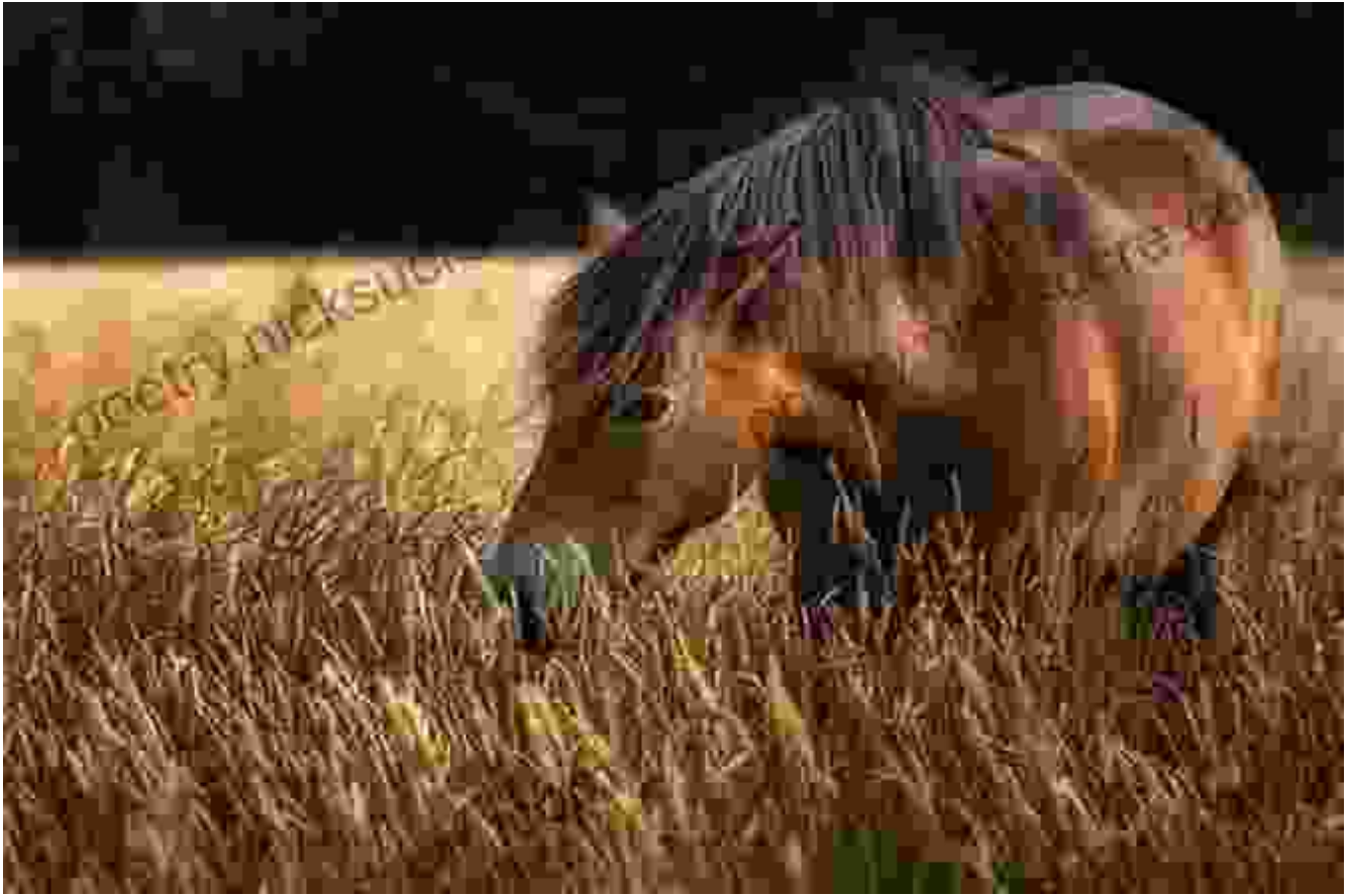
An October Horse grazing on grass.