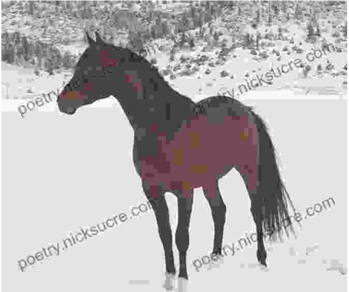
An October Horse standing in the snow.